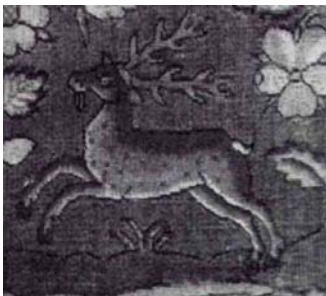
Deer from early 17 th c tentstitch panel. Silk on linen (Beck p51)

Sweetbags are often square in shape. You could adapt the pattern by moving the base star up 2 stitches and the top stars down 3 or 4 stitches. Remove 2 rows of stitches from the base and 15 from the top.