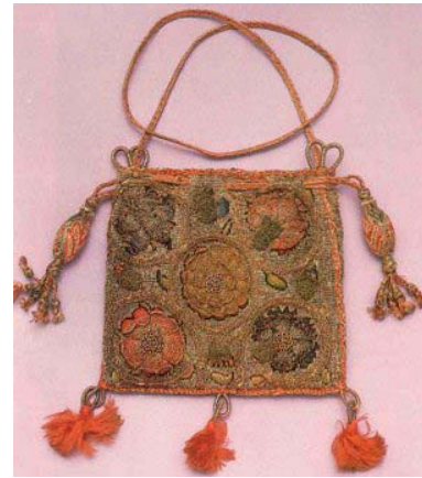
Sweet Bag, 1600. Silk thread on linen ground (Beck p18)

The deer is a common Elizabethan symbol and there were many delightful examples to choose from. I have used a dappled deer from a tentstitch panel for this pattern. Although I have given a full chart for this, it could also be worked as slips, then applied to a velvet ground. Another option would be to work it in shaded detached buttonhole stitch and again, apply it to a ground.