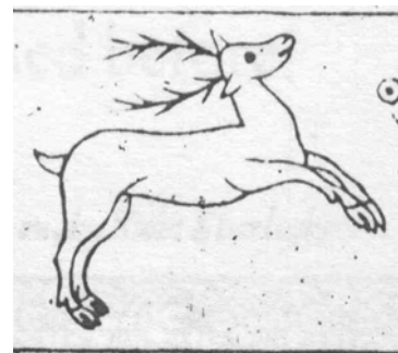
Pattern from A shole-house for the Needle (Shorleyker M3)