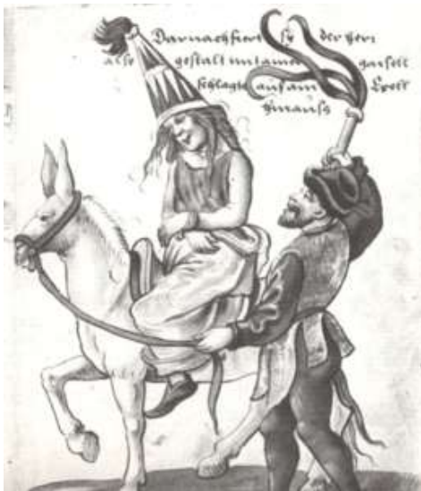
Flogging a Spanish female criminal 1532 from the Trachenbuch.