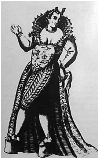
Wood cut of a Venetian Courtesan late C16