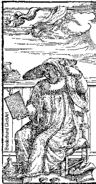
Cesare Vecellio's Costume Plates 1589. Venetian woman bleaching her hair in the sun on a rooftop gallery