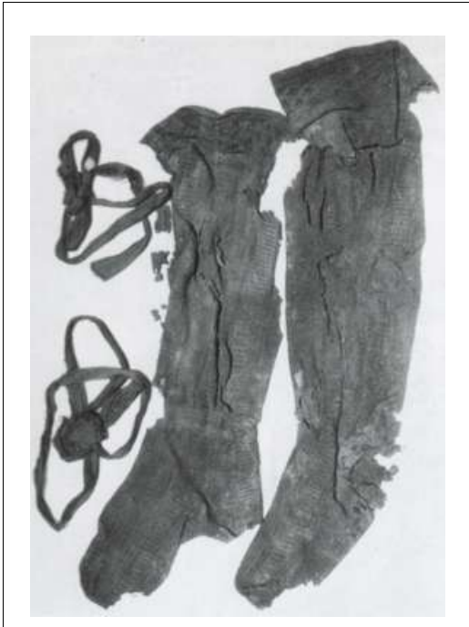
Stockings of crimson silk with garters from the Toledo burial