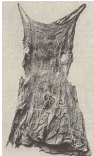
Extant linen chemise C14