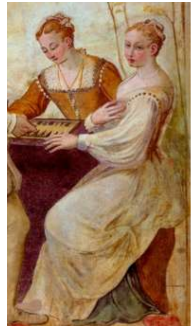
Fresco Venice 1565 showing an underskirt.