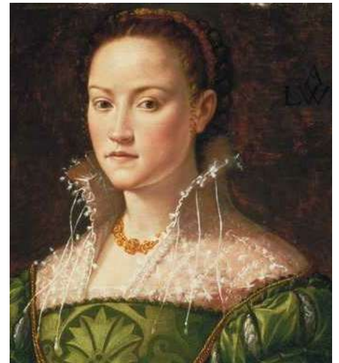
Partletts can be worn under or over the dress.