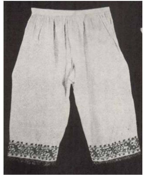
Extant Italian draws late C16