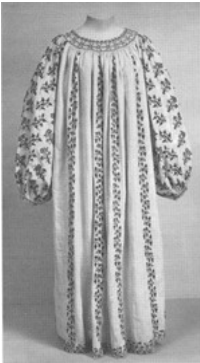
Extant Venetian chemise from the Metropolitan Museum of Art, New York.