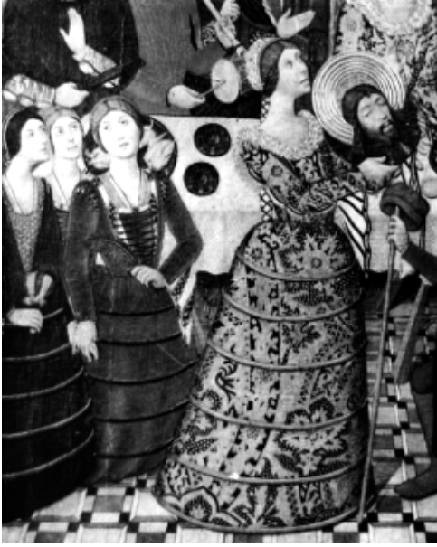
Farthingale: this shows early Spanish style farthingale.