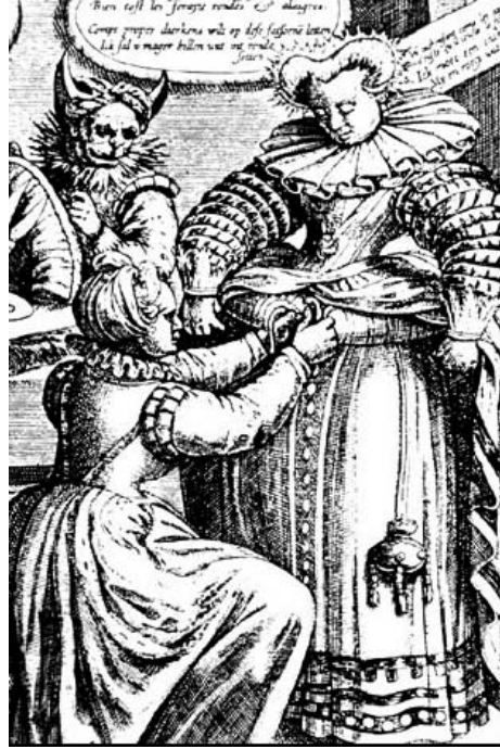
Bumroll being fitted.