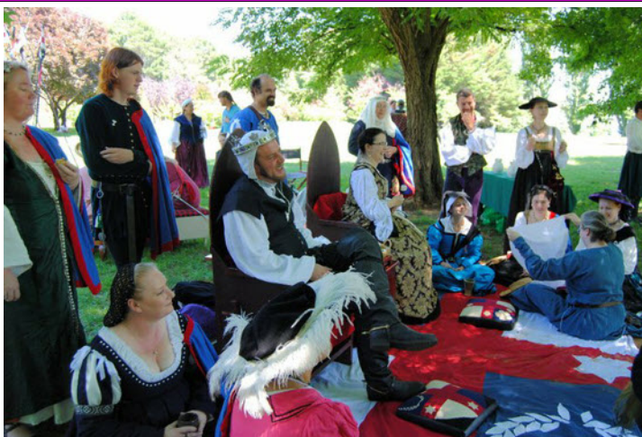
Their Majesties and attendants watching the Heave Tournament at 12th Night.