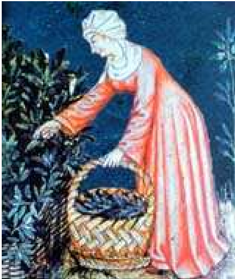
(A woman picking herbs, unknown Book of Hours, 14 th century)

(A selection of herbal digestive aides from the late 1500's – 1600's)